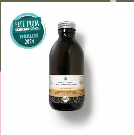
MICELLAR & TONER FOR NORMAL - DRY SKIN