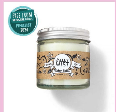
BABY SKIN BALM