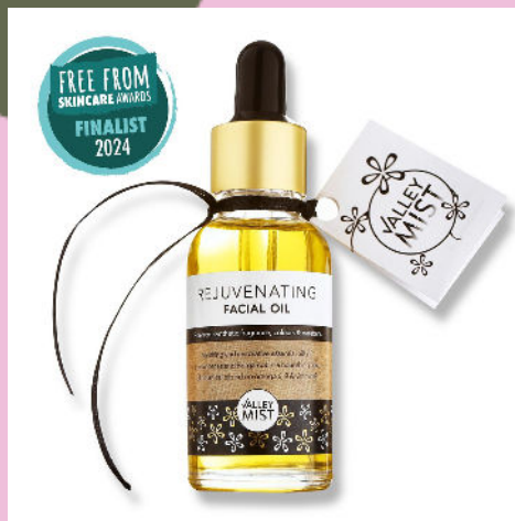
REJUVENATING FACIAL OIL